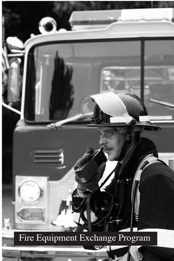
Fire Equipment Exchange Program

SEVENTEENTH BIENNIAL EDITION DECEMBER 2017