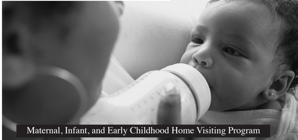
Maternal, Infant, and Early Childhood Home Visiting Program