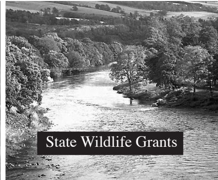
State Wildlife Grants