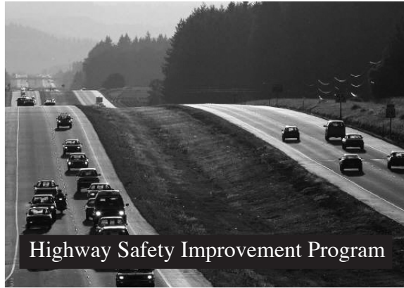
Highway Safety Improvement Program