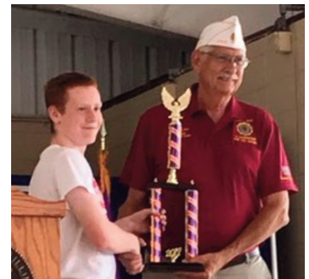
Aug 11, 2019, Illinois State Fair –members of the Illinois Army National Guard Recruiting & Retention Battalion awarded Junior Reserve Officers' Training Corps (JROTC) drill teams first, second and third prizes along with monetary gifts.