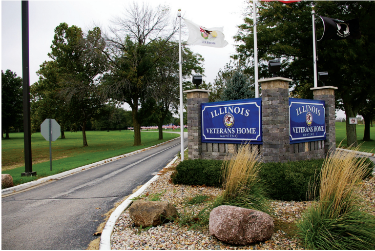
Illinois Veterans Home in Manteno

The Illinois Veterans' Home at Manteno (IVH-M), celebrated its 32nd year of service in April and continues to serve many northern and central Illinois veterans. The IVH-M is located on 122-acre campus 60 miles south of Chicago; approximately 143 acres of additional property is farmed with the proceeds of that lease being placed in the Manteno Home Fund. The Home provides a comfortable residence for the veterans in a peaceful rural setting and has a post office, library, bank, beauty/barber shop, and commissary which services up to 294 residents. The campus features a 1 ½ acre man-made pond that is stocked and landscaped, with a pavilion where veterans can enjoy the outdoors and “catch-and-release” fishing.