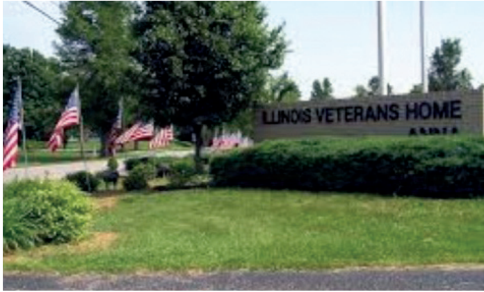
Illinois Veterans' Home in Anna

The Illinois Veterans' Home at Anna (IVH-Anna) is a 50-bed, skilled care nursing facility with six adjoining domiciliary units for 12 residents. Situated on a 16.1-acre site in Union County, the Home provides long-term skilled nursing care services, rehabilitative, and social services.