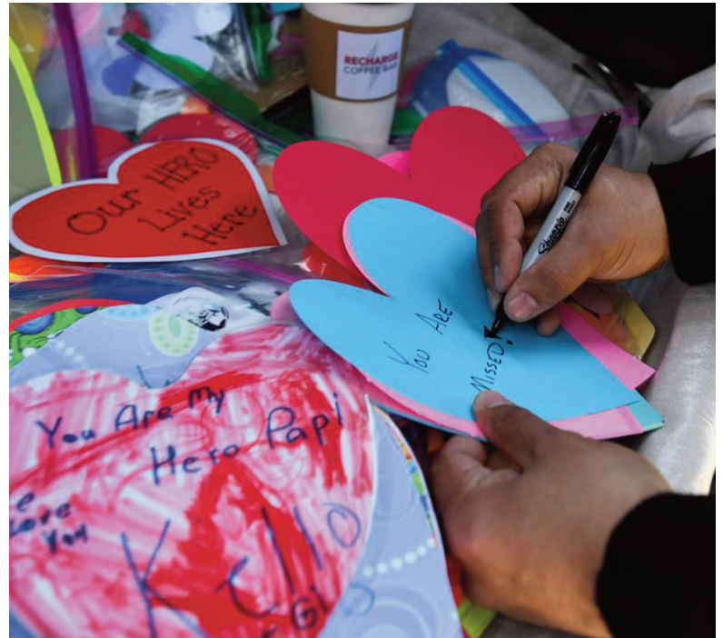
Figure 2-Operation Rising Spirit continues to boost spirits of our veterans and staff during COVID-19.