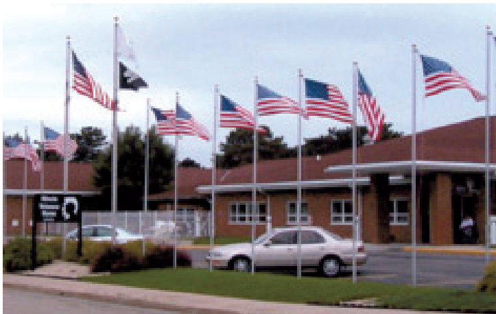
Illinois Veterans' Home in LaSalle

The Illinois Veterans' Home at LaSalle (IVH-LaSalle) opened on December 12, 1990. With the 2008 construction of an 80-bed addition, IVH-LaSalle now houses 163 veterans in both general skilled care and special needs unit providing care to residents suffering from dementia related health issues.