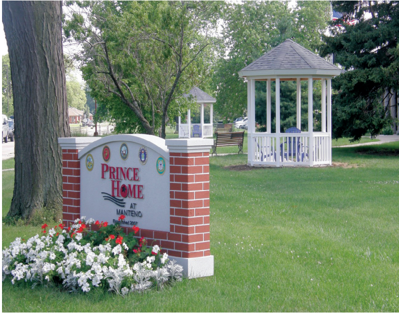
Prince Home for homeless and disabled veterans

Located on the grounds of the Manteno Veterans' Home, the Prince Home for homeless and disabled veterans is a separate program with a dedicated staff and program director. The Prince Home opened in 2007 to provide permanent supportive housing for men and women veterans in its 15-bed facility.