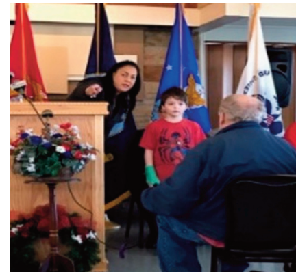
Pearl Harbor Remembrance Day at Springfield Elks Lodge #158