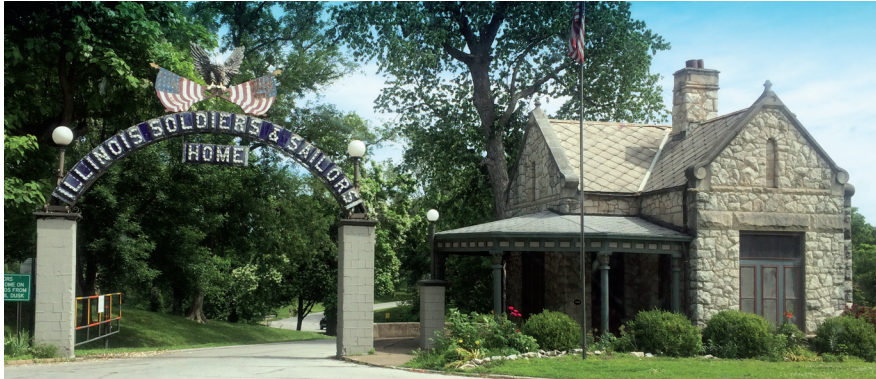
One of the entrances to the Quincy Veteran's Home

In 1886, the 34th Illinois General Assembly passed legislation to establish a soldiers' and sailors' home for disabled Illinois veterans of the Mexican and Civil Wars. On June 1, 1886 Governor Richard Oglesby, selected Quincy as the site of the new home. On October 19, 1886, the Illinois Soldiers' and Sailor's Home was formally dedicated. In June 1973, the name was changed to the Illinois Veterans' Home at Quincy (IVH-Quincy).