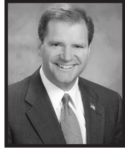
Senator Bill Brady Senate Republican Leader